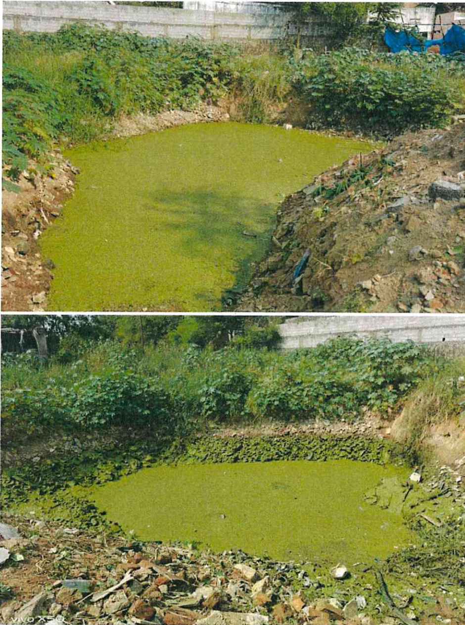
Pumping out of the well water.

Photographs showing the progress of the works at Applicant's Land.