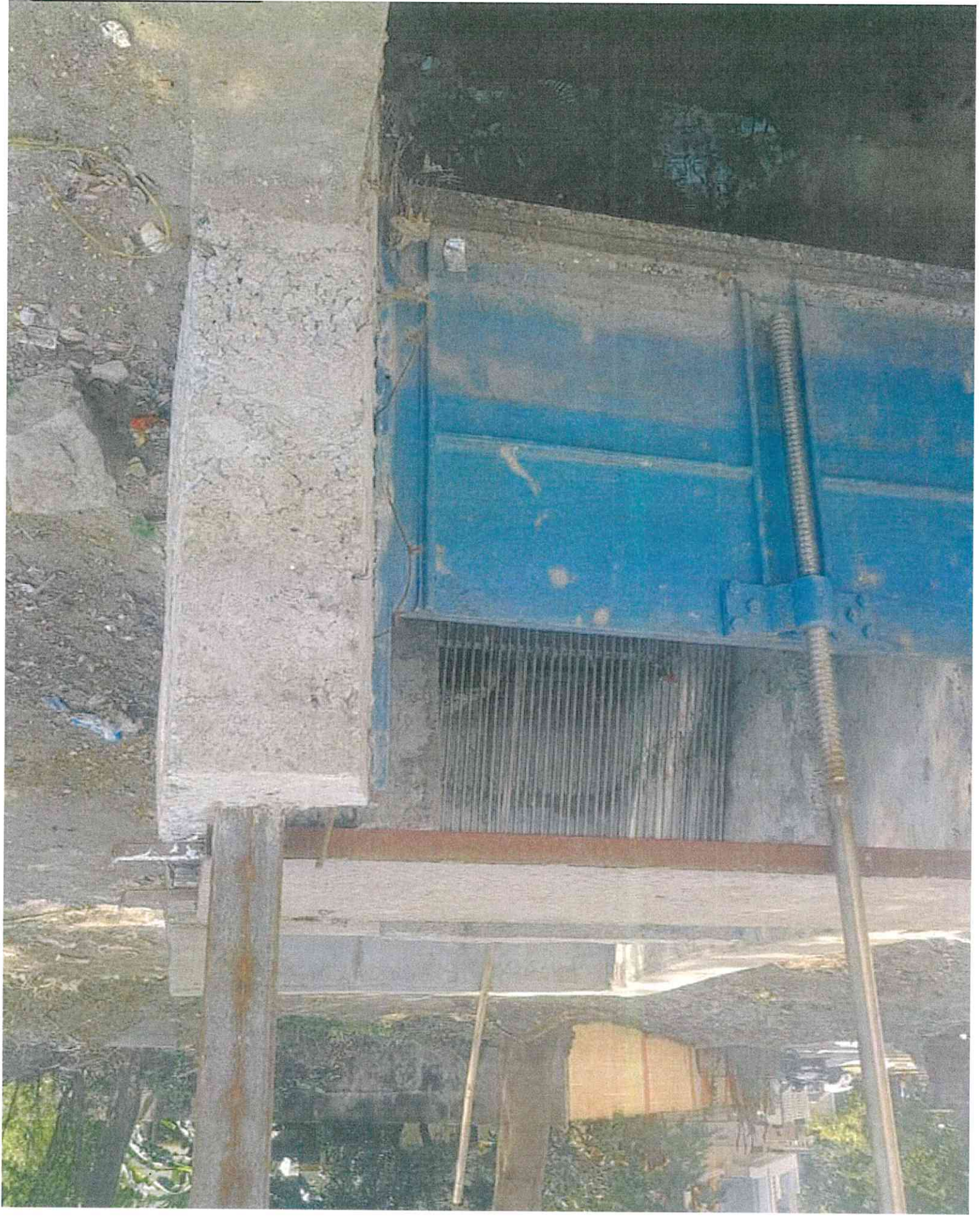
7 ANNEXURE-II CONSTRUCTION OF I & D STRUCTURES