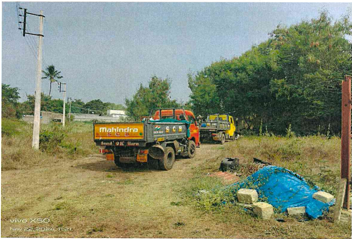
Removal of the bottom sediment from the open well.