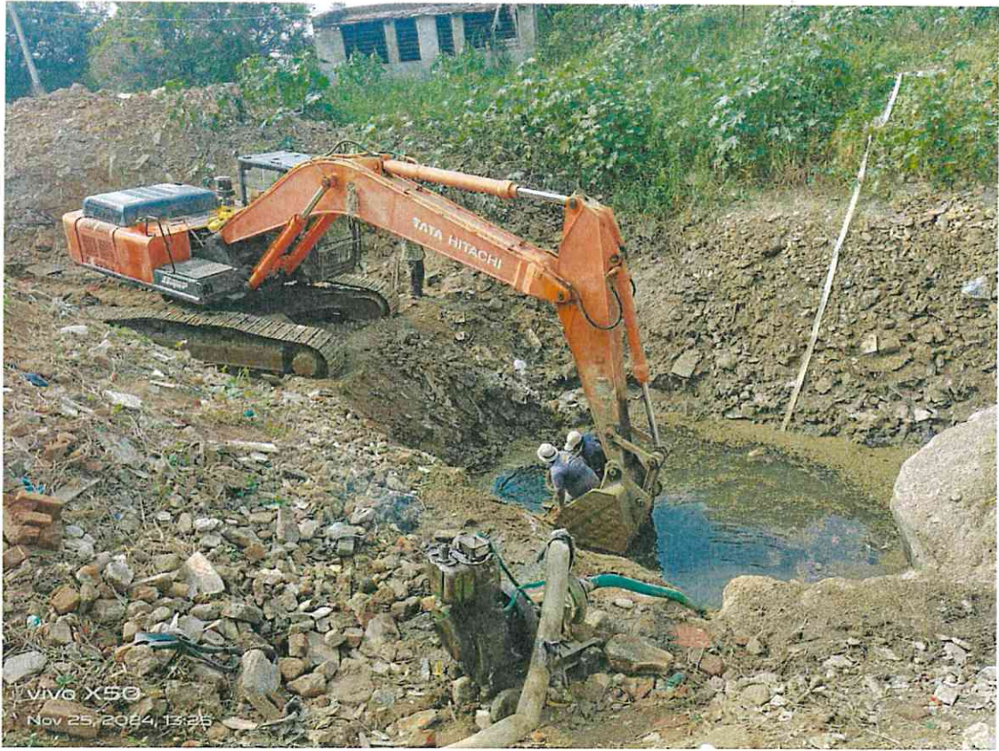
Removing the bottom sediment from the open well